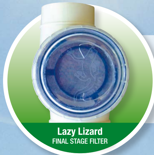
Lazy Lizard FINAL STAGE FILTER

The Wet Frog second stage constant filtration system is the ideal solution for wet systems. It is designed as a completely sealed unit to filter through a 500 micron stainless steel mesh that removes fine silt that can damage washing machines when using rainwater from tanks. (CODE: WFFILTER)