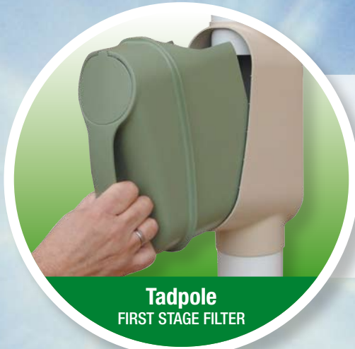
Tadpole FIRST STAGE FILTER

A good filter will prevent mosquitos and clean rainwater of most impurities normally collected from your roof and gutters