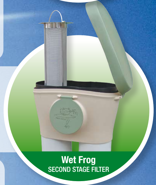
Wet Frog SECOND STAGE FILTER

The Tadpole is a first stage filter designed for wet and dry systems, through a 5.0mm and 0.9mm dual stainless steel filtration mesh the Tadpole prevents biological growth and insect breeding (mosquitoes) No need to clean leaves and debris from basket type rainheads. (CODE: TPFILTER)