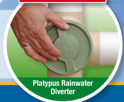
Platypus Rainwater Diverter